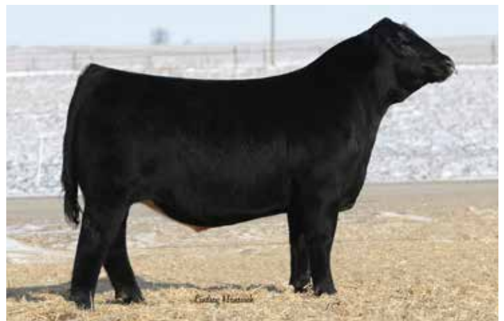
WLE Big Iron - PE Sire of Recip Lots