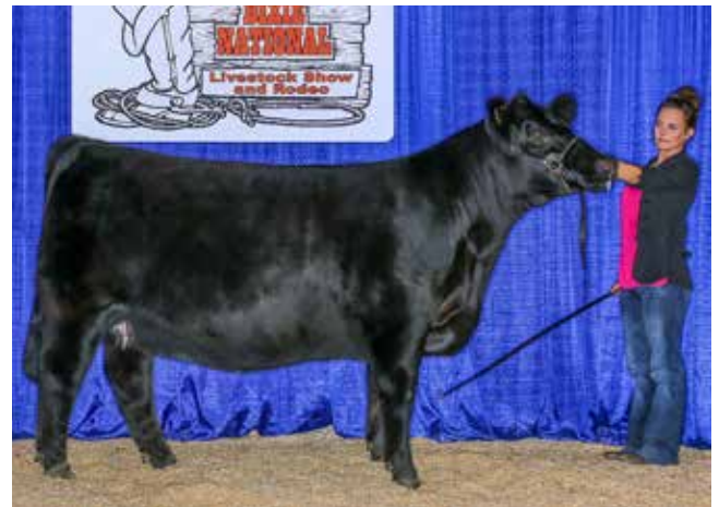
W/C Miss Werning 5127C - Dam of Lot 39