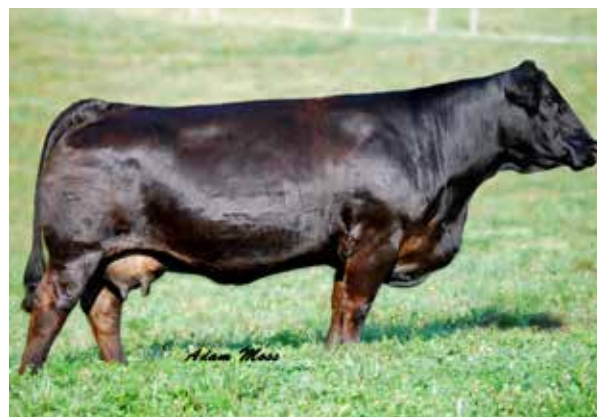
CVLS Ms Georgia 565R - Granddam of Lot 18