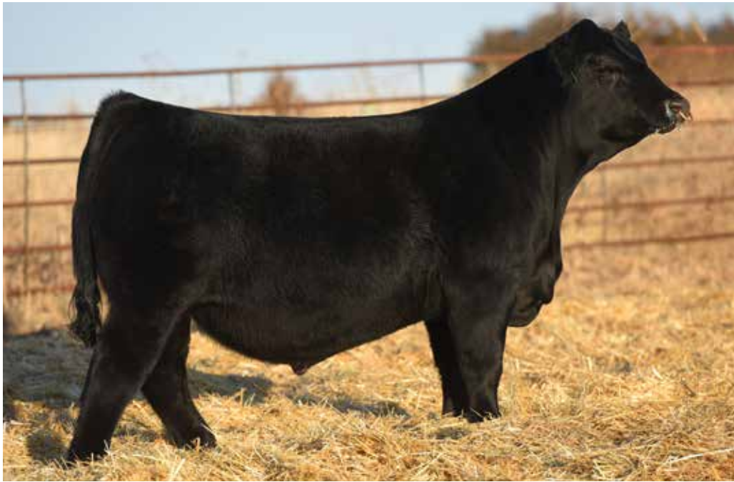
KCC1 Execute - AI Sire of Lots 39-41