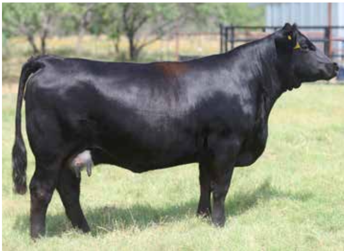
WLE Missy X407 - Dam of Lot 9 and 10