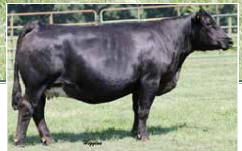
WLE/LWSC Missy A407 - Dam of Lot 5