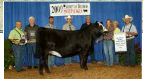
2009 Supreme Champion Female - Simmental Breeder's Sweepstakes