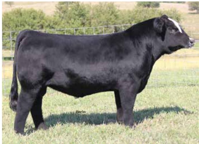
Mr. CCF Vision - Sire of Lot 9