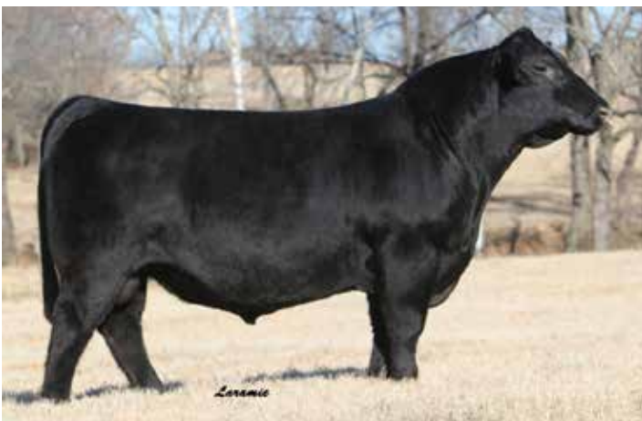
WLE Copacetic E02 - Sire of Pregnancy Lots