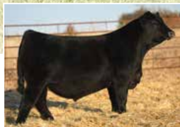
KCC1 Execute 109E - AI Sire of Lot 3