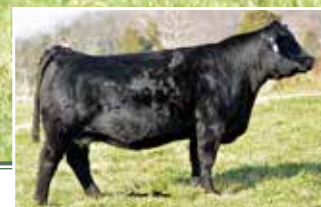
SS Sweet Dream - Dam of Lots 12A-C