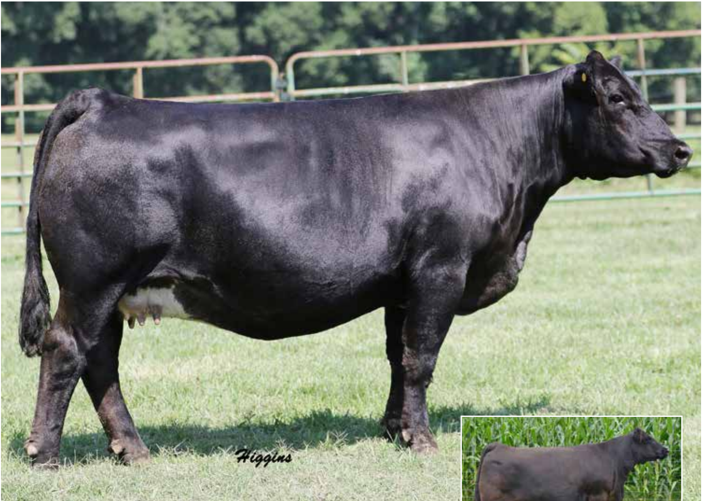
WLE/LWSC Missy A407