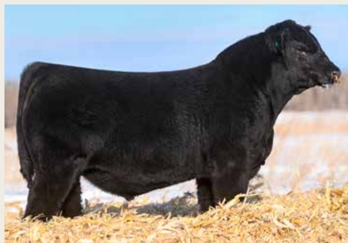
KCC1 Game Changer 76G - AI Sire