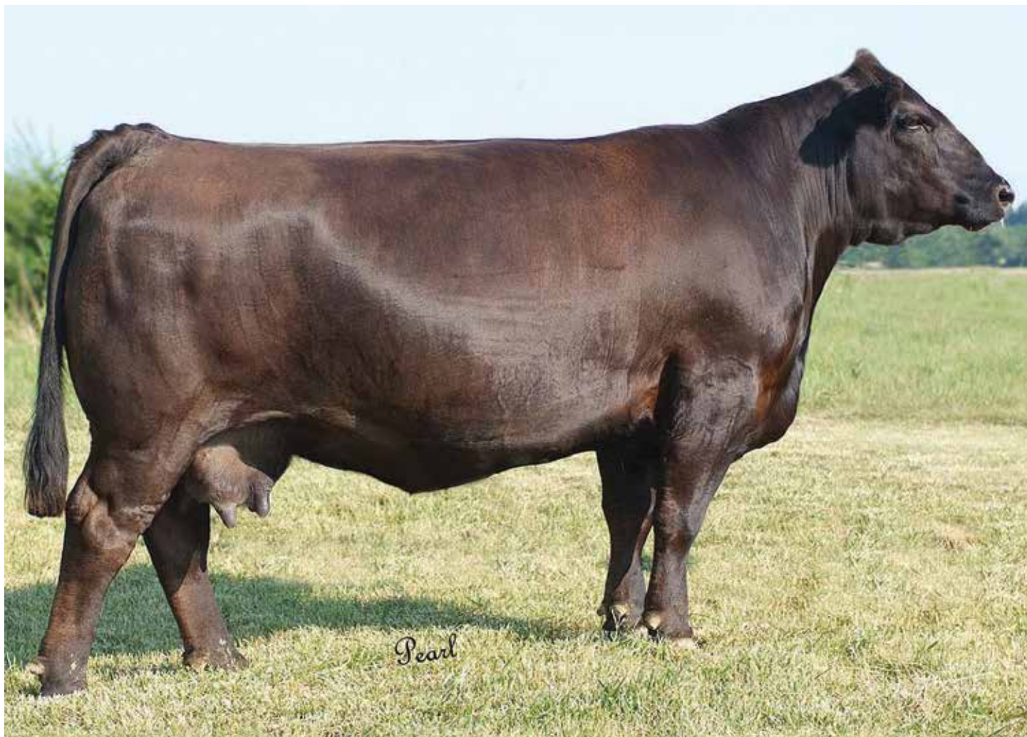
SAFN She's Glamorous - Dam of Lot 15