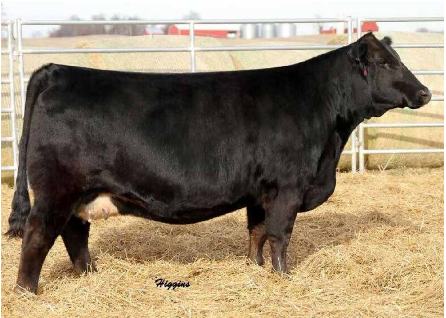
WLE Missy Z4293 - Dam of Pregnancy Lots