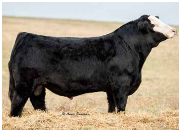
SSC Shell Shocked 44B - Sire of Lot 24A