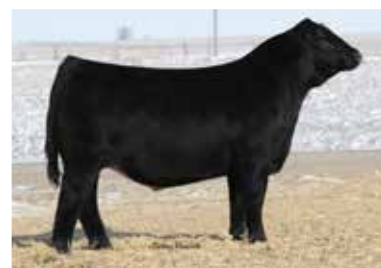
WLE Big Iron E205

Bred AI to Deplorabull, ASA#3150188 on 6/2/20