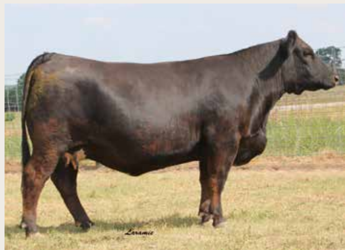
OBCC Miss H25 910B - Dam of Lot 20