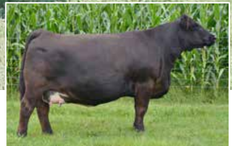
Shawnee Miss 770P - Granddam of Lots 5-11