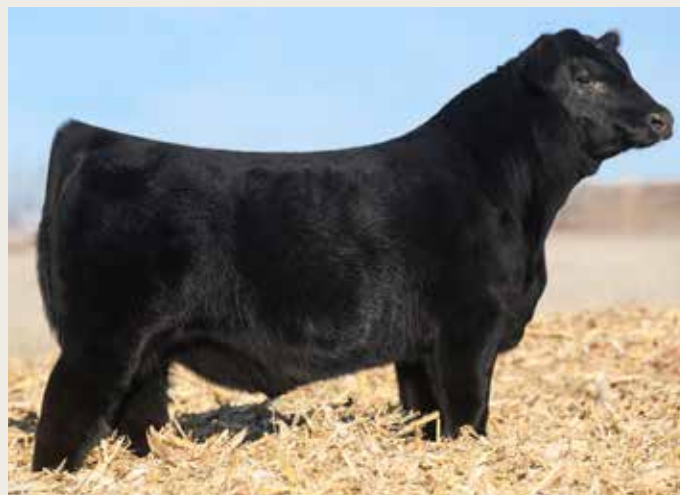
TKCC Fever 823F - Sire of Lot 25A