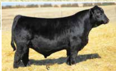
CCR Wide Range 9005A - Sire of Lot 2A